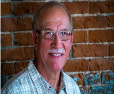
Mayor Charles D. Infelt