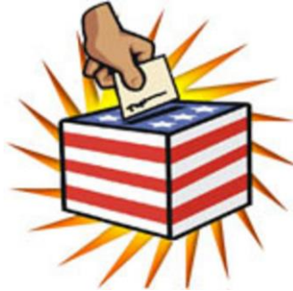
Local Option Sales and Service Vote