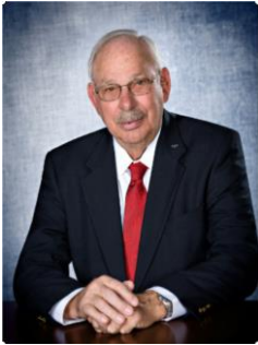
Mayor Dean Soash