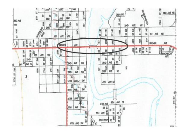
ABOVE: Overall survey area. The west side is reported in HADB# 09-026.