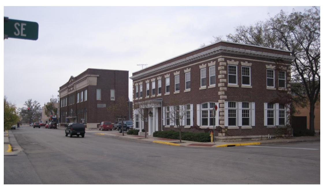
Looking northeast. The 1914 bank at 100 E. Bremer Ave. is in the background.