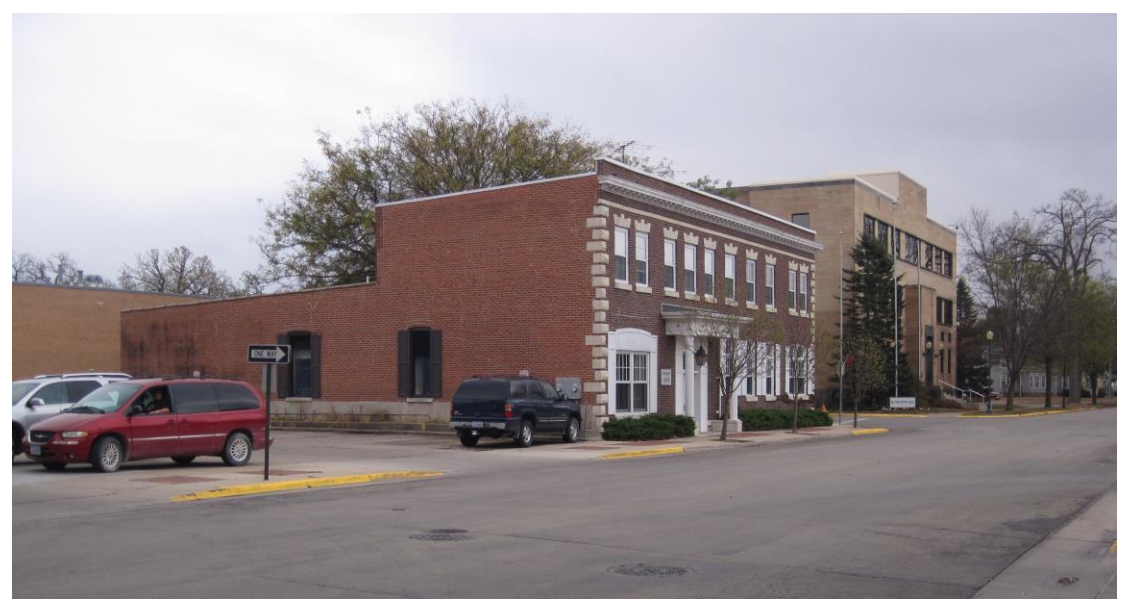
Looking southeast. Lutheran Mutual Aid Society headquarters building is in the background (201 1st St. SE).