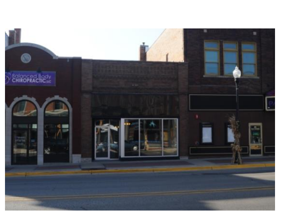
94 E Bremer Ave