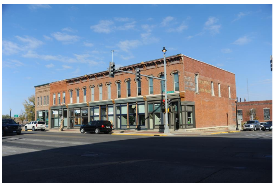
Left to Right: 89, 91, 93, 95, 97, and 99 E Bremer Ave