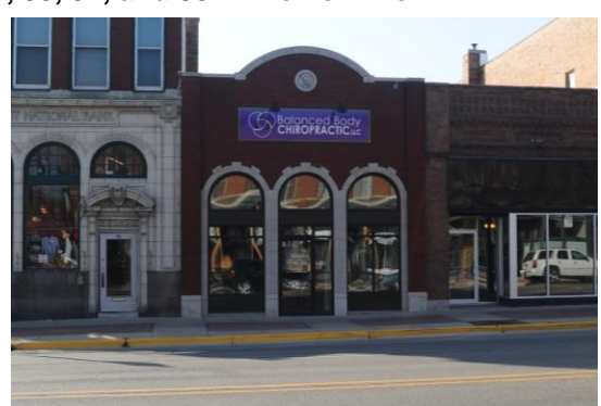
96 E Bremer Ave