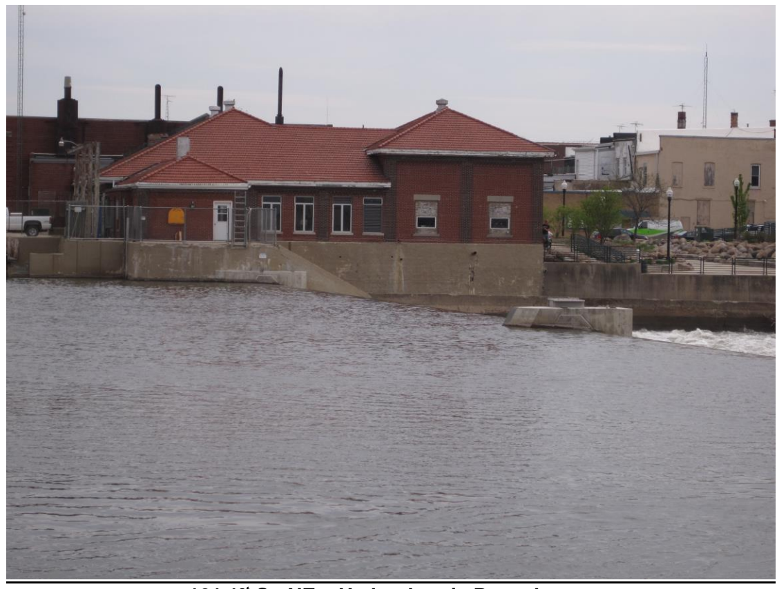
121 1st St. NE - Hydroelectric Powerhouse