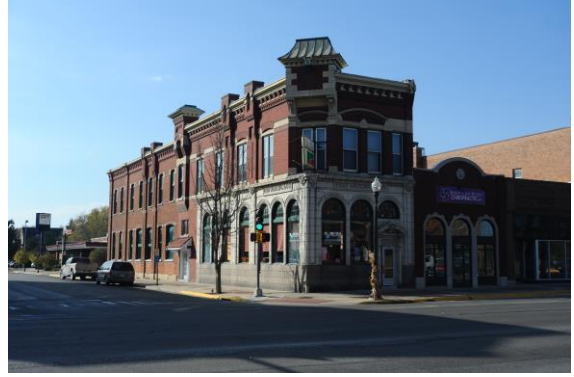
98 E Bremer Ave