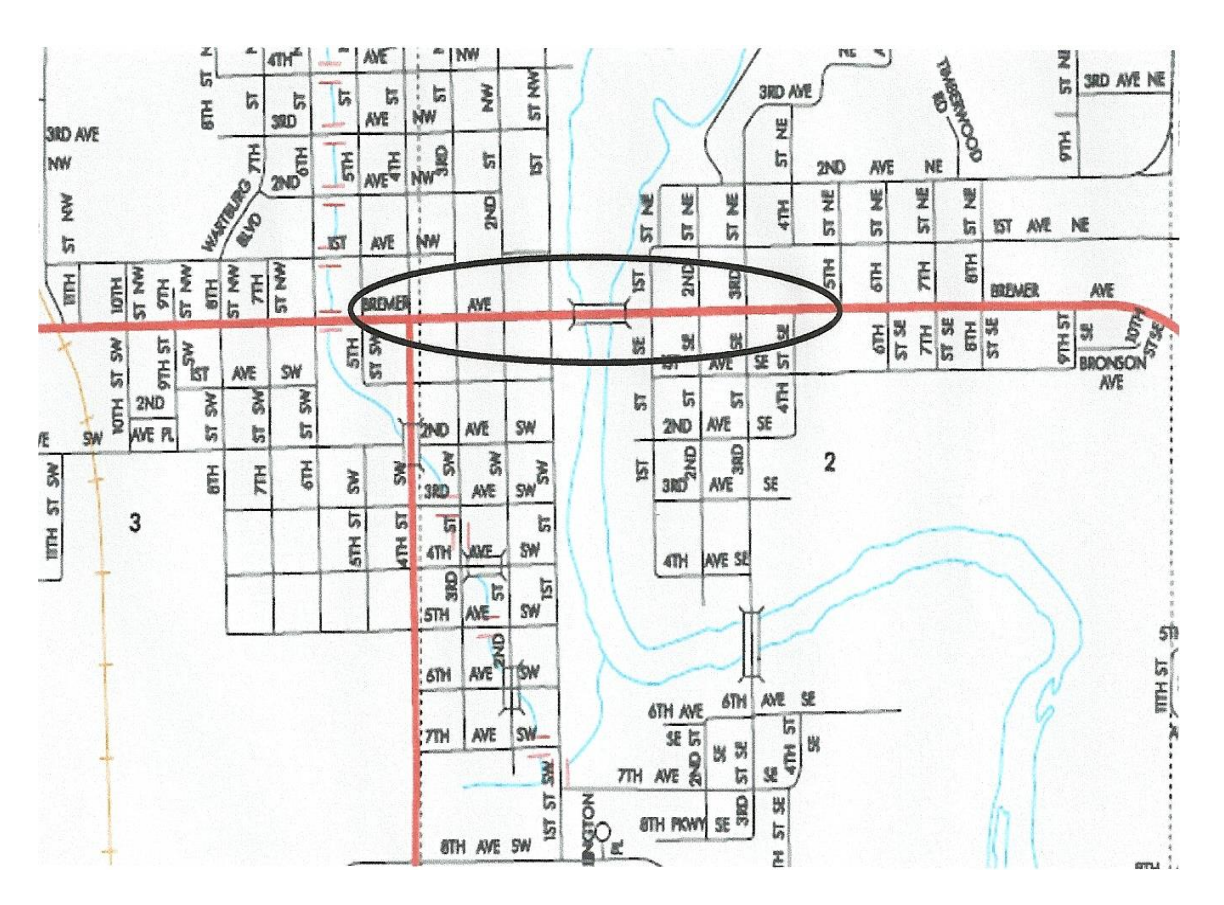
Overall central city with entire survey area circled. West side survey reported as HADB# 09-026