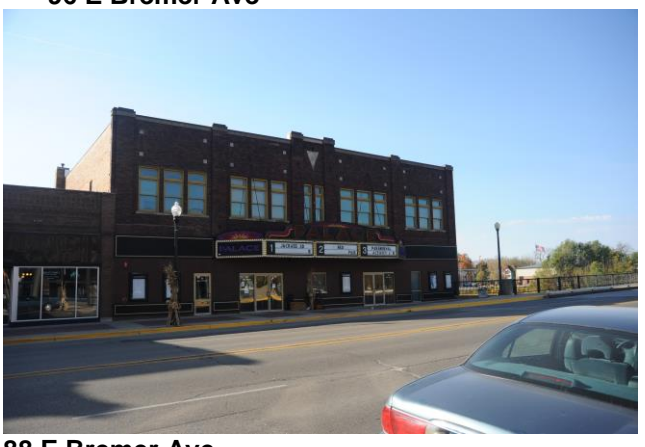
88 E Bremer Ave