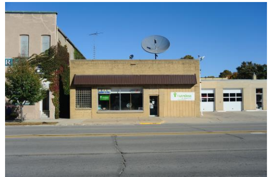
305 E Bremer Ave