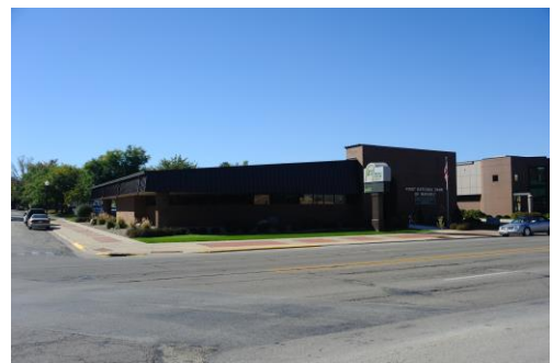
316 E Bremer Ave