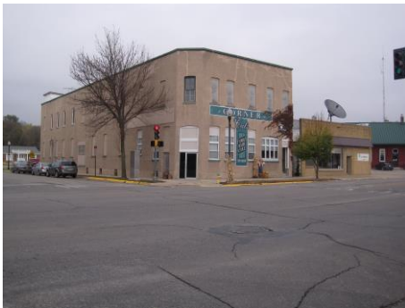
301 E Bremer Ave