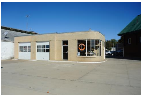
309 E Bremer Ave