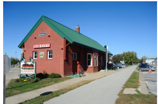
311 E Bremer Ave