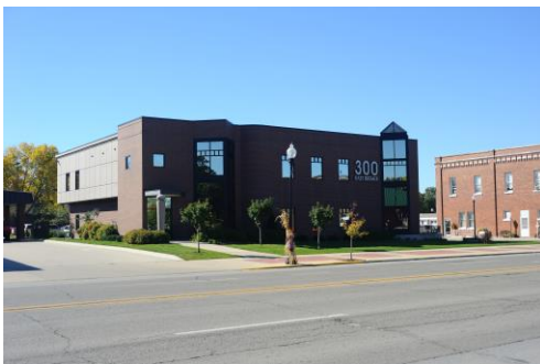
300 E Bremer Ave