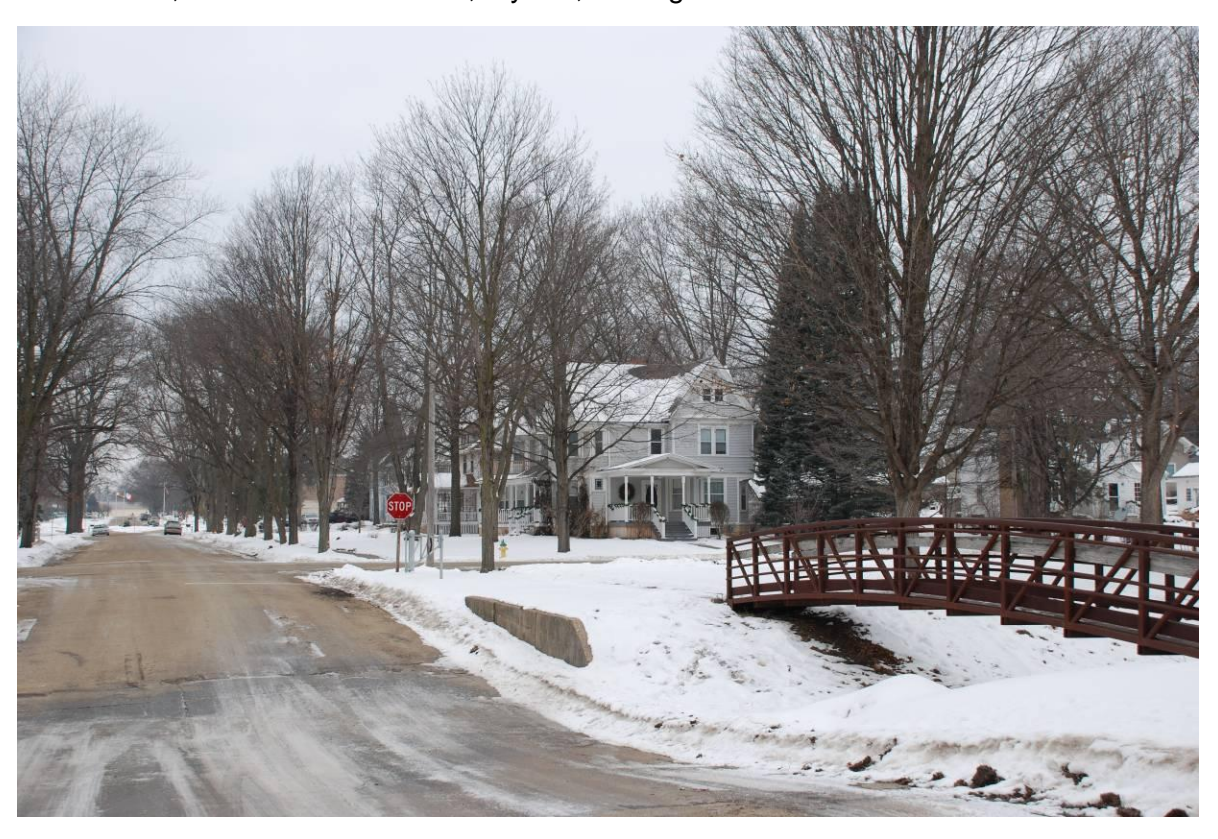
600 block 1st Ave NW, looking northeast