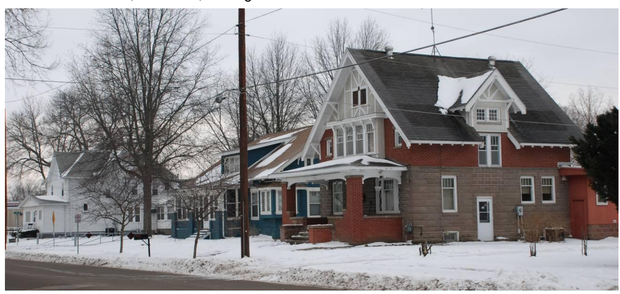
600 block 4th Ave NW, looking northwest