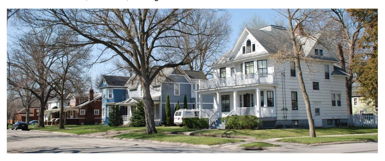
400 block \mathbf{4}^{\text{th}} St NW, west side, looking northwest

500 block 2<sup>nd</sup> St NW, west side, looking southwest