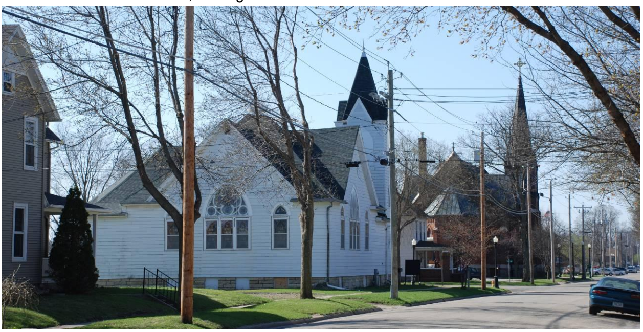
200 block 2<sup>nd</sup> Ave NW, north side, looking east

300-400 blocks of 2<sup>nd</sup> St NW, looking southeast