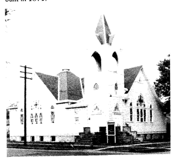
Faith United Methodist

Faith United Methodist Church of Waverly, located at 124 Third Avenue N.W., was originally known as the "Evangelical Association." It began in 1861, when Waverly became the nucleus of an extended mission field of 13 stations or classes. Waverly started with six members, German speaking people, who met in homes or the courthouse until their first church was built in 1871.