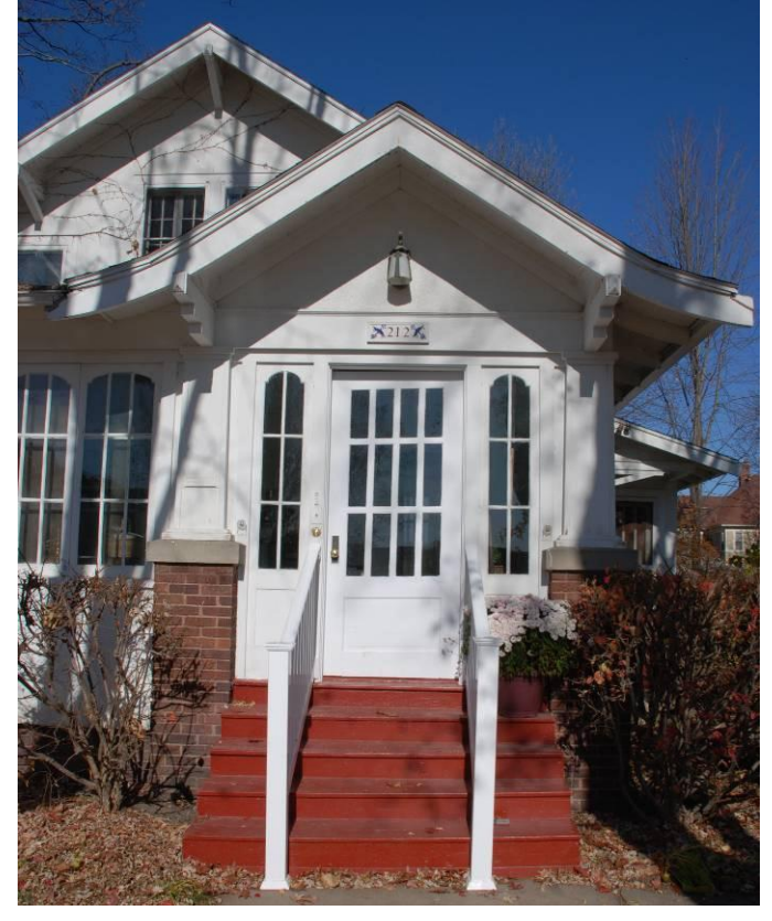
Photographs: 212 2<sup>nd</sup> Ave NW, looking northeast and entrance, looking north, Marlys Svendsen, Svendsen Tyler, Inc., photographer, 11/3/2011.