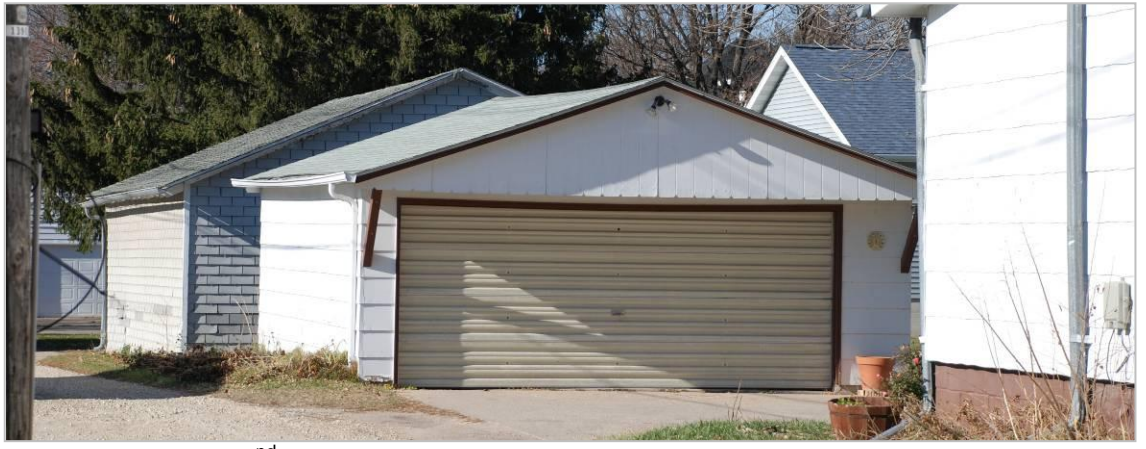
Photograph: 415 2<sup>nd</sup> St NW, south half, foundation detail, looking west, Justine Zimmer, IHSEMD, photographer, 4/23/2009.