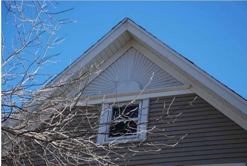
Photographs: 416 2 nd St NW, looking east and porch detail, looking northeast, Marlys Svendsen, photographer, 11/3/2011.