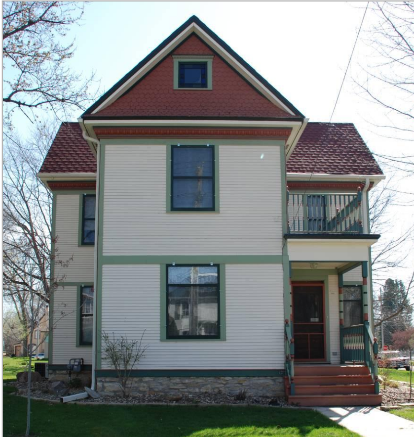
Photographs: 502 2nd St NW, looking east and north, Justine Zimmer, IHSEMD, photographer, 4/23/2009.