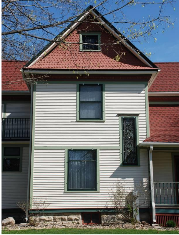
Photographs: 502 2nd St NW, looking south & window details, Marlys Svendsen, Svendsen Tyler, Inc., photographer, 11/15/2011.