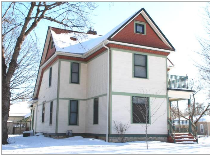
Photographs: 502 2nd St NW, winter views, looking southeast, northeast, northwest and garage, looking northeast, Justine Zimmer, IHSEMD, photographer, 1/24/2009.