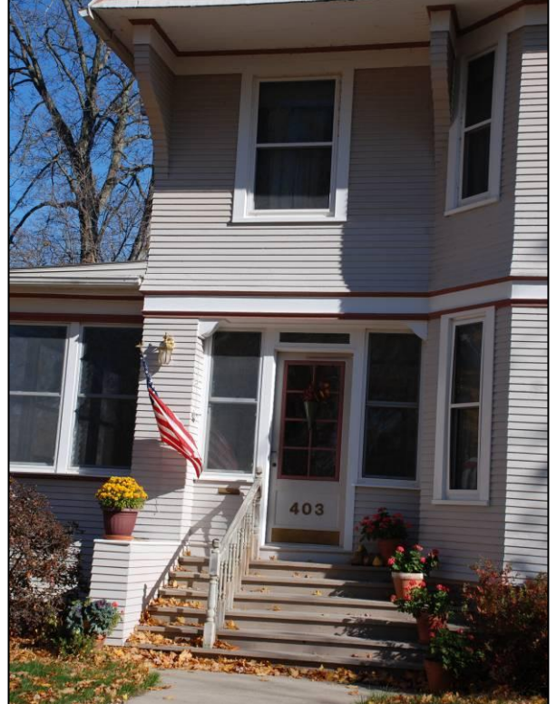
Photographs: 403 2<sup>nd</sup> St. SE, front gable and entrance details, looking east; side porch, looking southwest, 11/3/2011