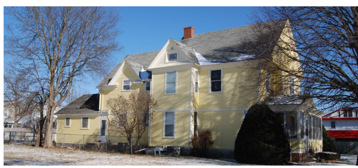
Photographs: 416 1<sup>st</sup> Avenue SW, looking northeast and east; garage, looking east and north, 11/28/14