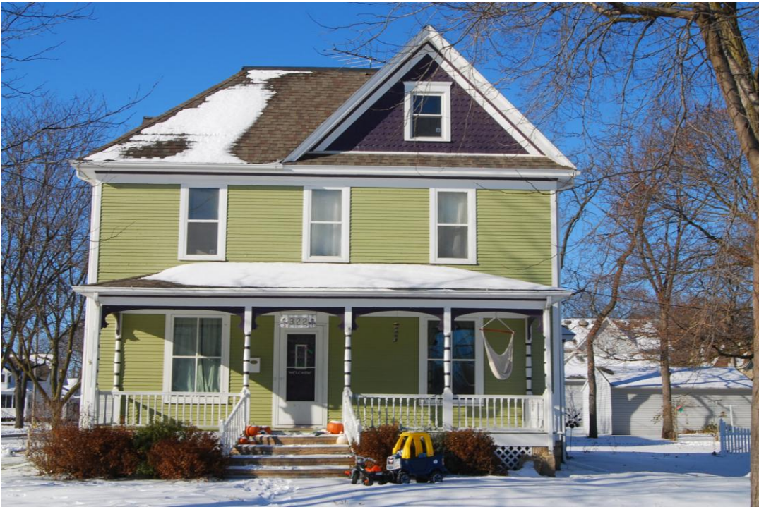
Photographs: 322 1 st Street SW, looking west and southwest, 12/5/13, Andrew Bell, Svendsen Tyler, photographer.