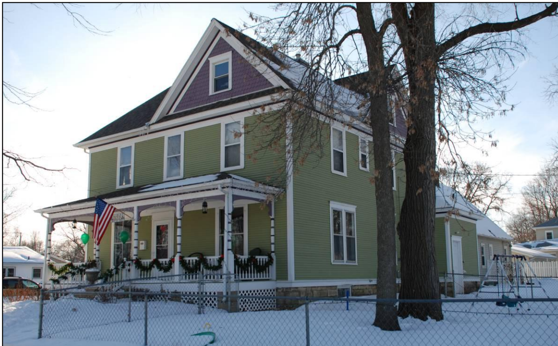
Photographs: 322 1 st Street SW, looking southwest, 1/24/2009