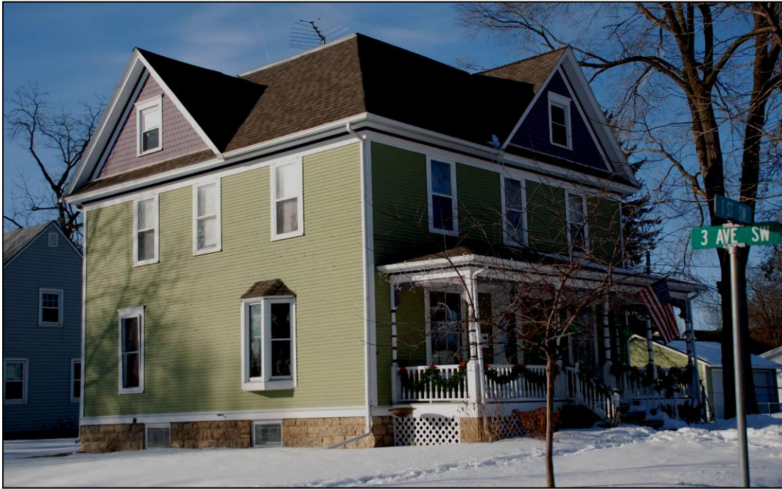
Photographs: 322 1 st Street SW, looking northwest and west, 1/24/2009