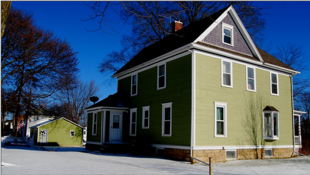
Photographs: 322 1 st Street SW, looking northeast and north, 12/5/13, Andrew Bell, Svendsen Tyler, photographer.