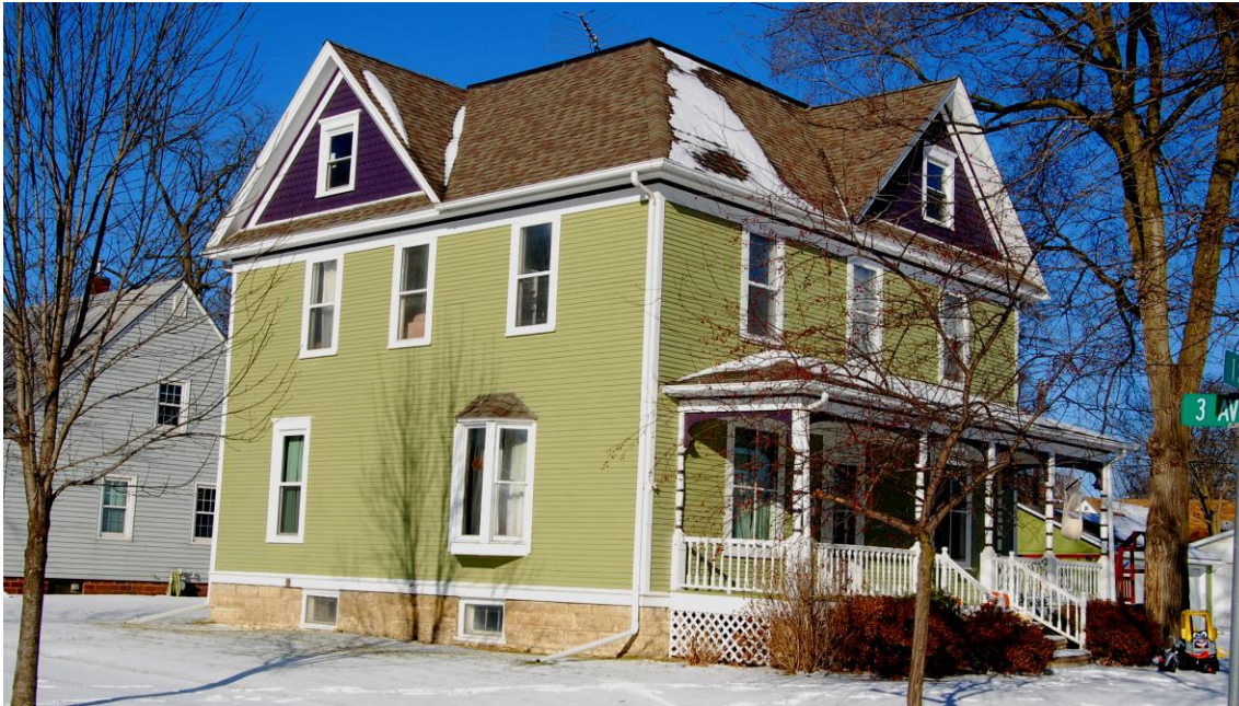
Photographs: 322 1 st Street SW, looking northwest and porch looking northwest, 12/5/13, Andrew Bell, Svendsen Tyler, photographer.