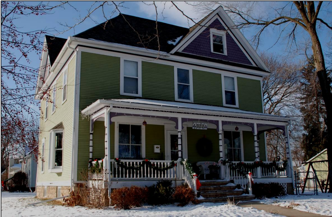
Photographs: 322 1 st Street SW, looking northwest and southwest, 12/5/13, Marlys Svendsen, IHSEMD, photographer.