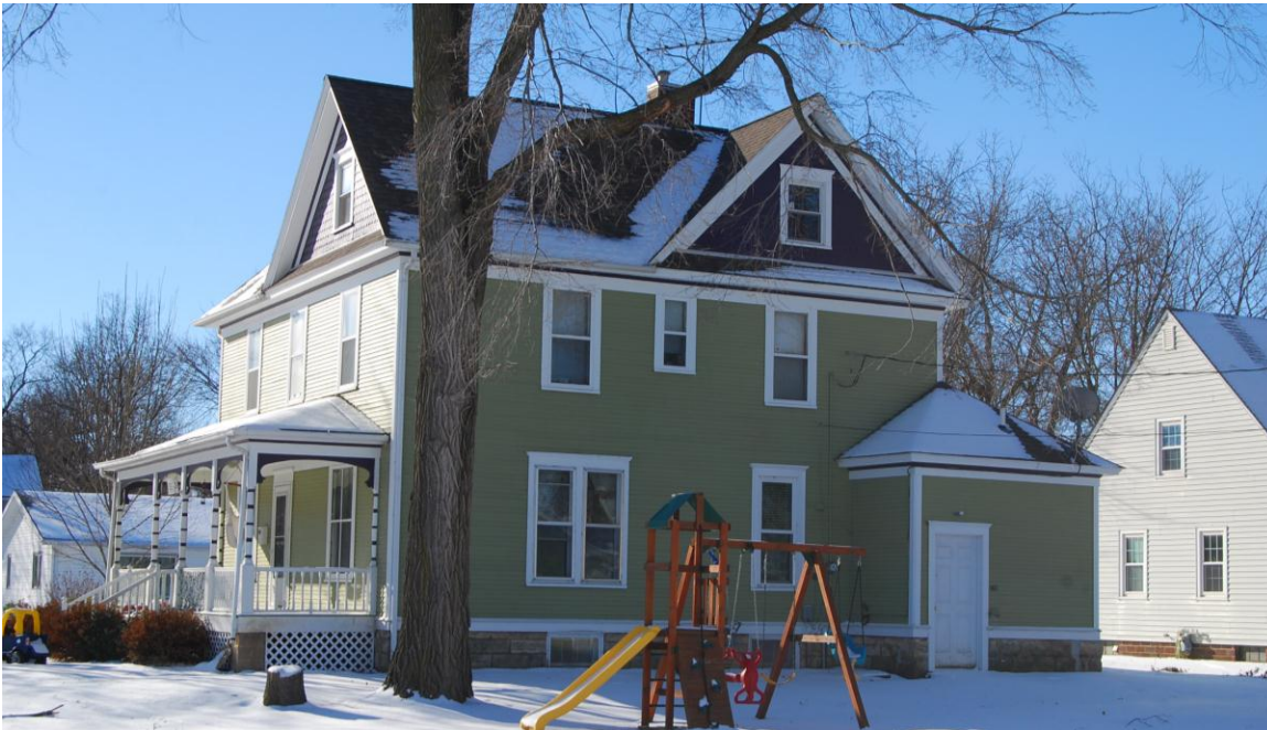
Photographs: 322 1 st Street SW, looking southwest and garage, looking northwest and north along alley, 12/5/13 , Andrew Bell, Svendsen Tyler, photographer.