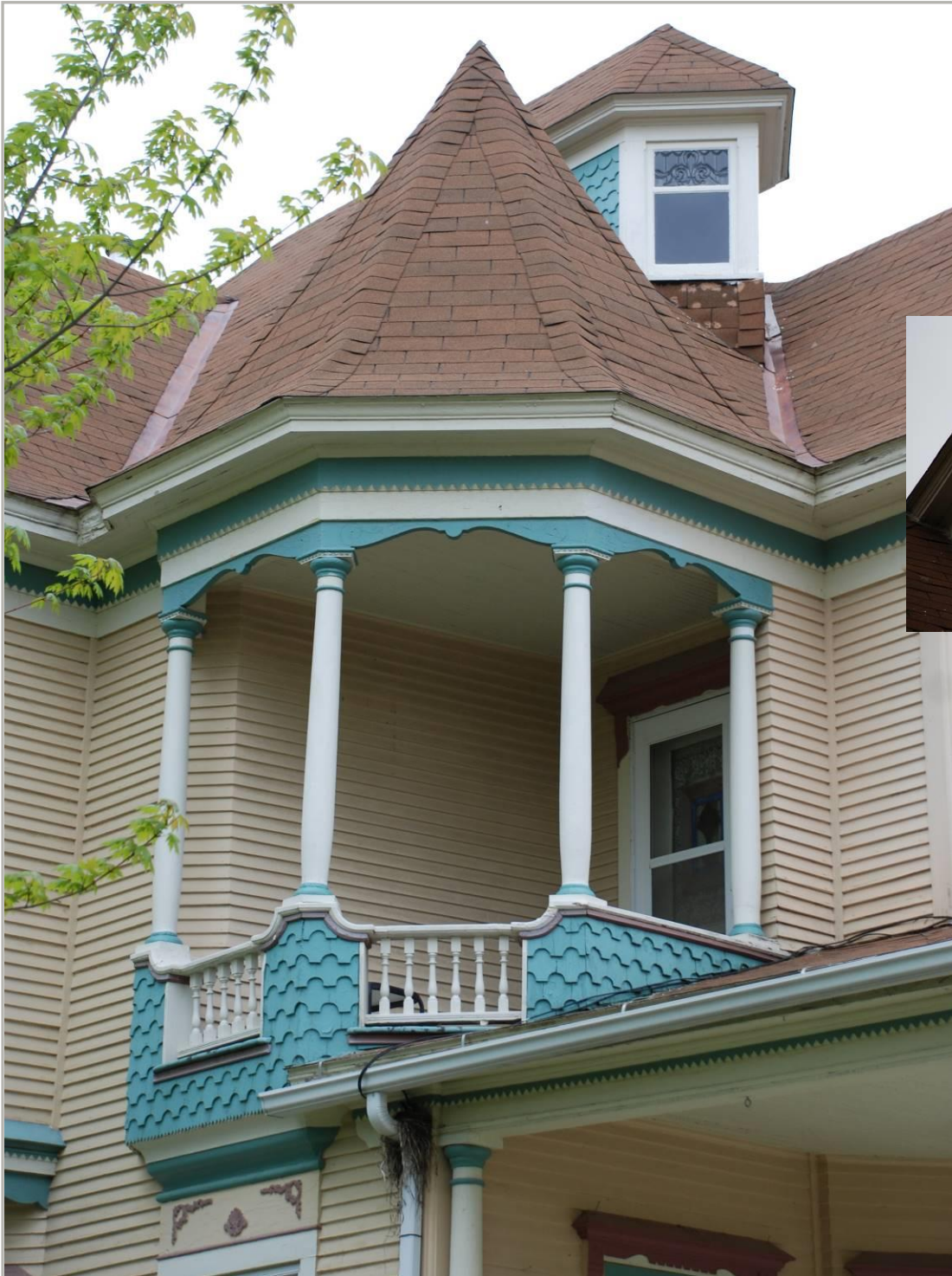
Photographs: 308 2 nd Street SW, second floor turret-balcony detail with hipped peak attic dormer, looking northwest and west, 5/14/2014