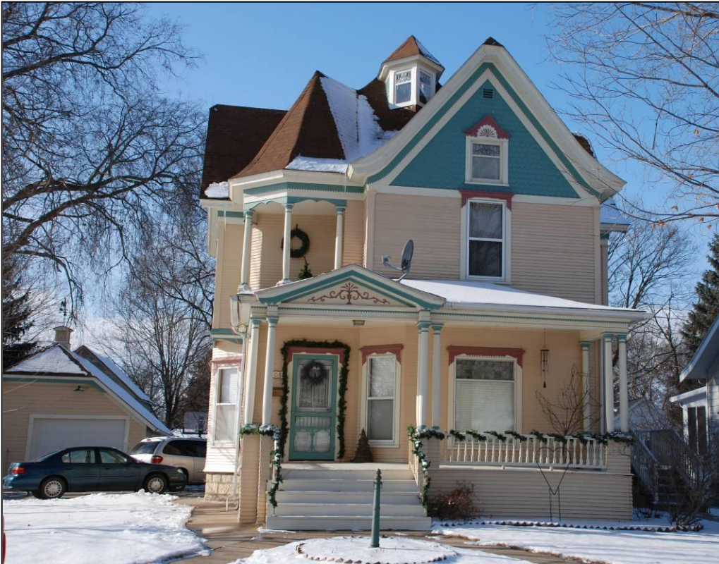
Photographs: 308 2 nd Street SW, looking west and northwest, 12/06/2010