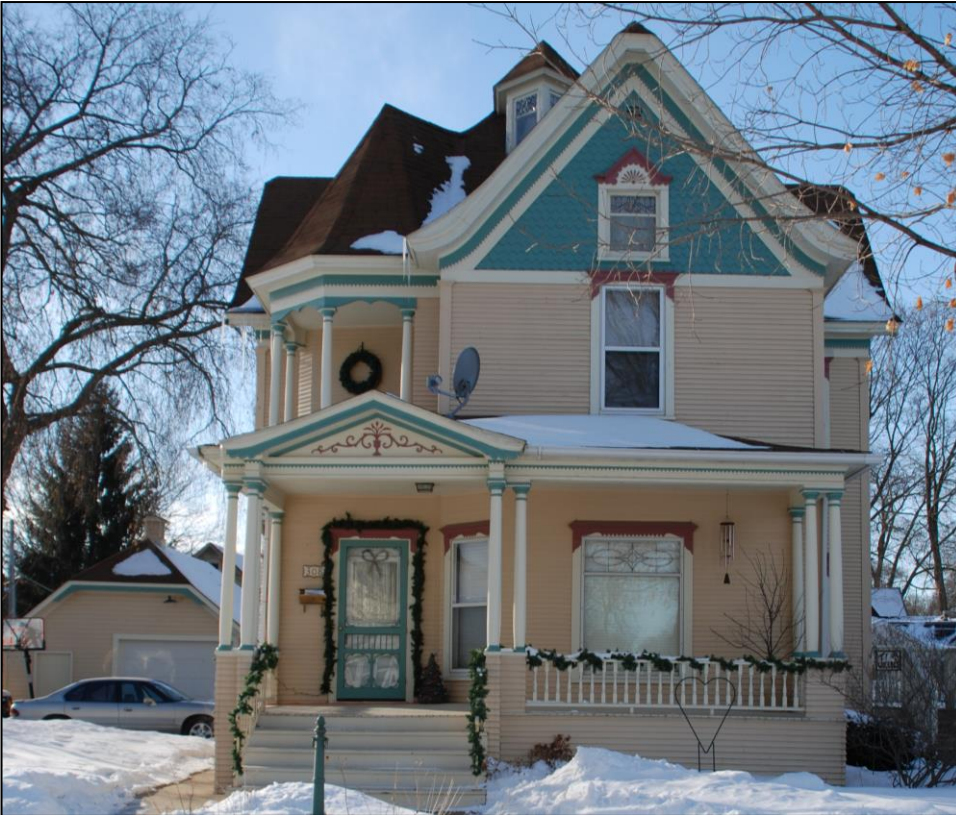
Photographs: 308 2 nd Street SW, looking west and southwest, 1/24/2009