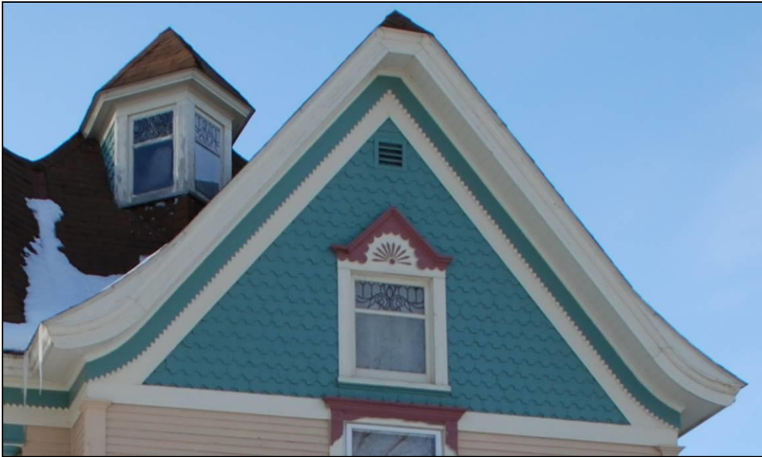
Photographs: 308 2 nd Street SW, gable and porch details, looking west, 1/24/2009