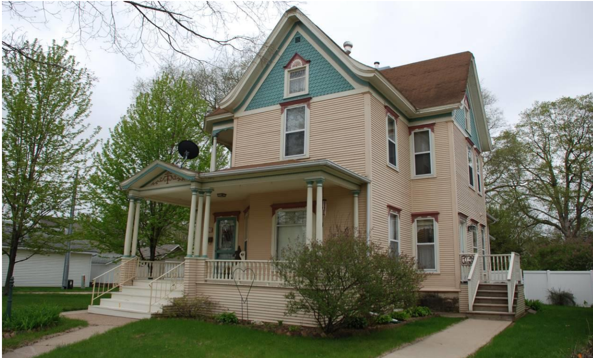
Photographs: 308 2 nd Street SW, front façade and gable details, looking southwest and west, 5/14/2014