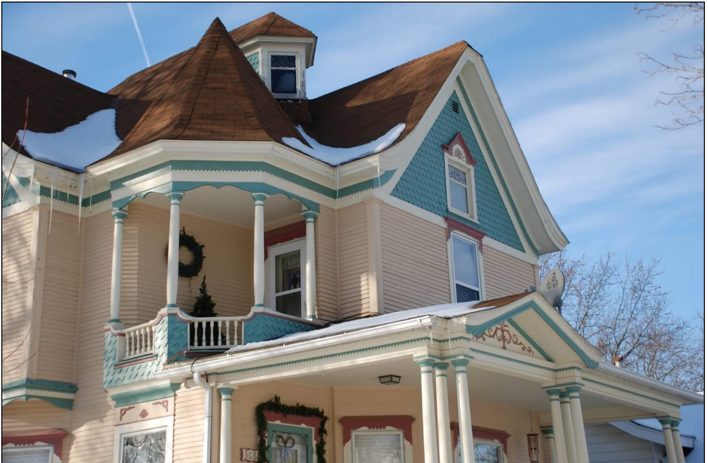
Photographs: 308 2 nd Street SW, upper level and dormer/gable window details, looking northwest, 1/24/2009, Justine Zimmer, IHSEMD, photographer