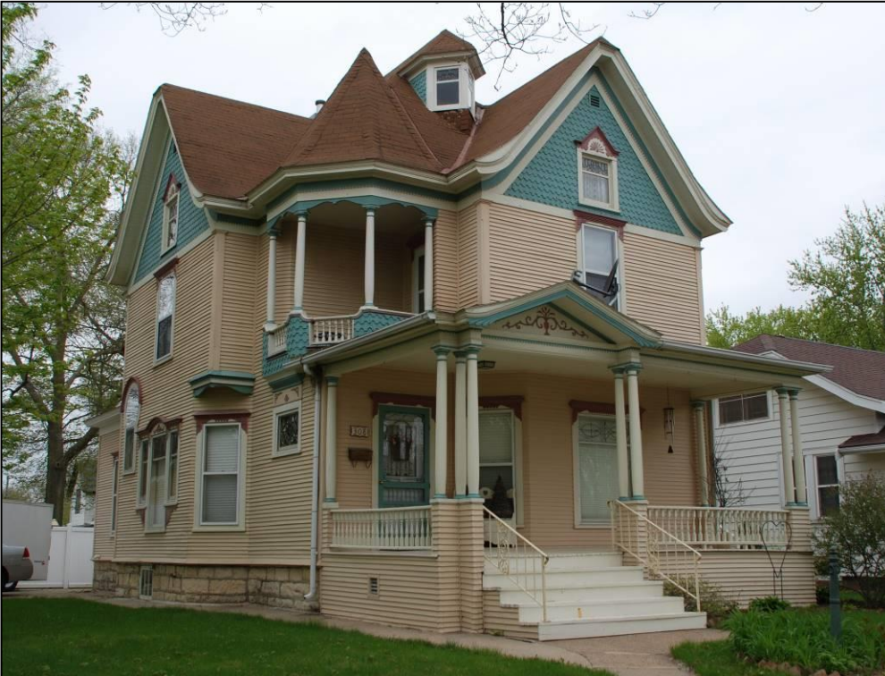
Photographs: 308 2 nd Street SW, looking southwest and porch detail, looking west, 5/14/2014, Marlys Svendsen, photographer.