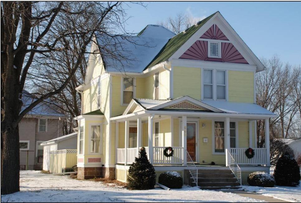
Photographs: 502 4 th Street SW, looking northwest and west, 12/06/2010