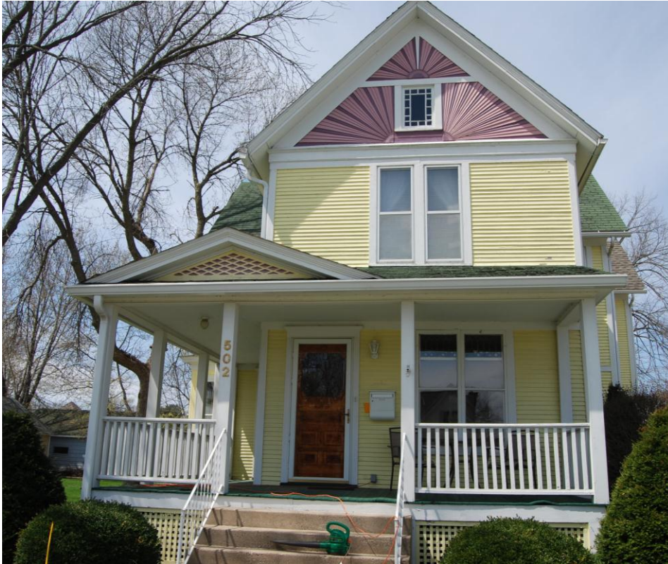
Photographs: 502 4 th Street SW, looking west and northwest, 5/15/2014, Marlys Svendsen, photographer.