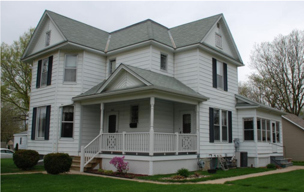
Photographs: 320 2nd St SW, house and porch detail, looking southwest, 4/7/2014, Andrew Bell, Svendsen Tyler, photographer.