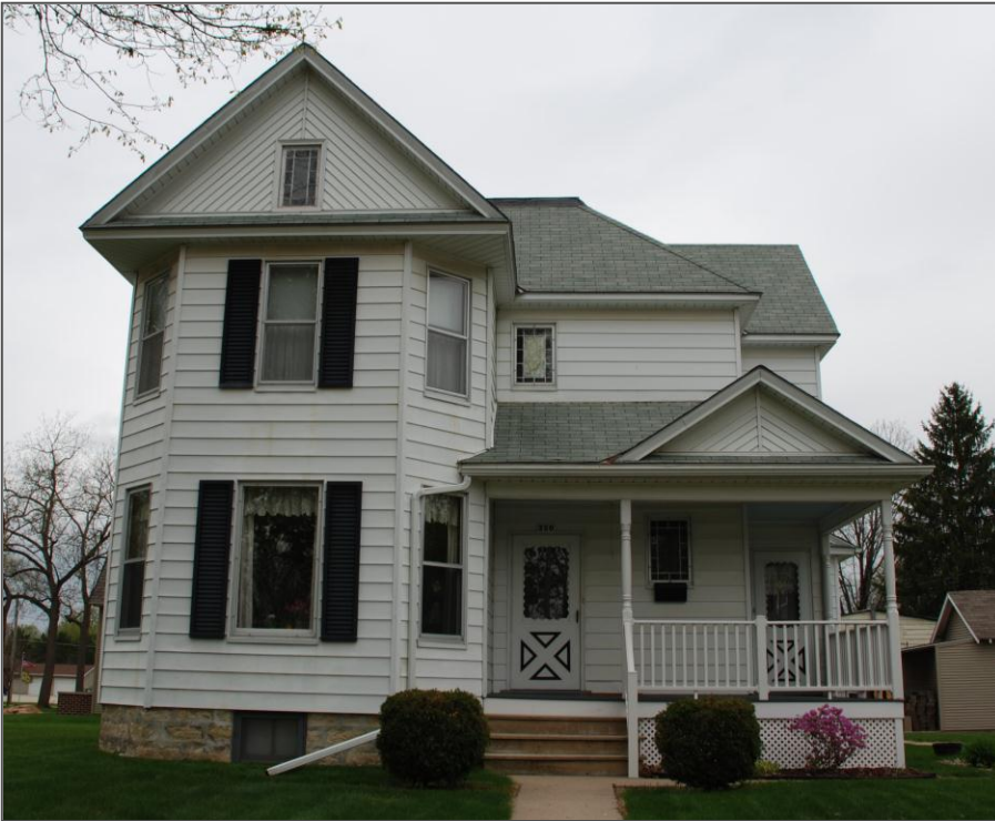
Photographs: 320 2nd St SW, looking west and northwest, 4/7/2014, Andrew Bell, Svendsen Tyler, photographer.