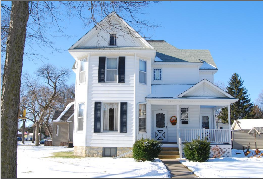
Photographs: 320 2nd St SW, looking west and north, 12/5/2013, Andrew Bell, Svendsen Tyler, photographer.