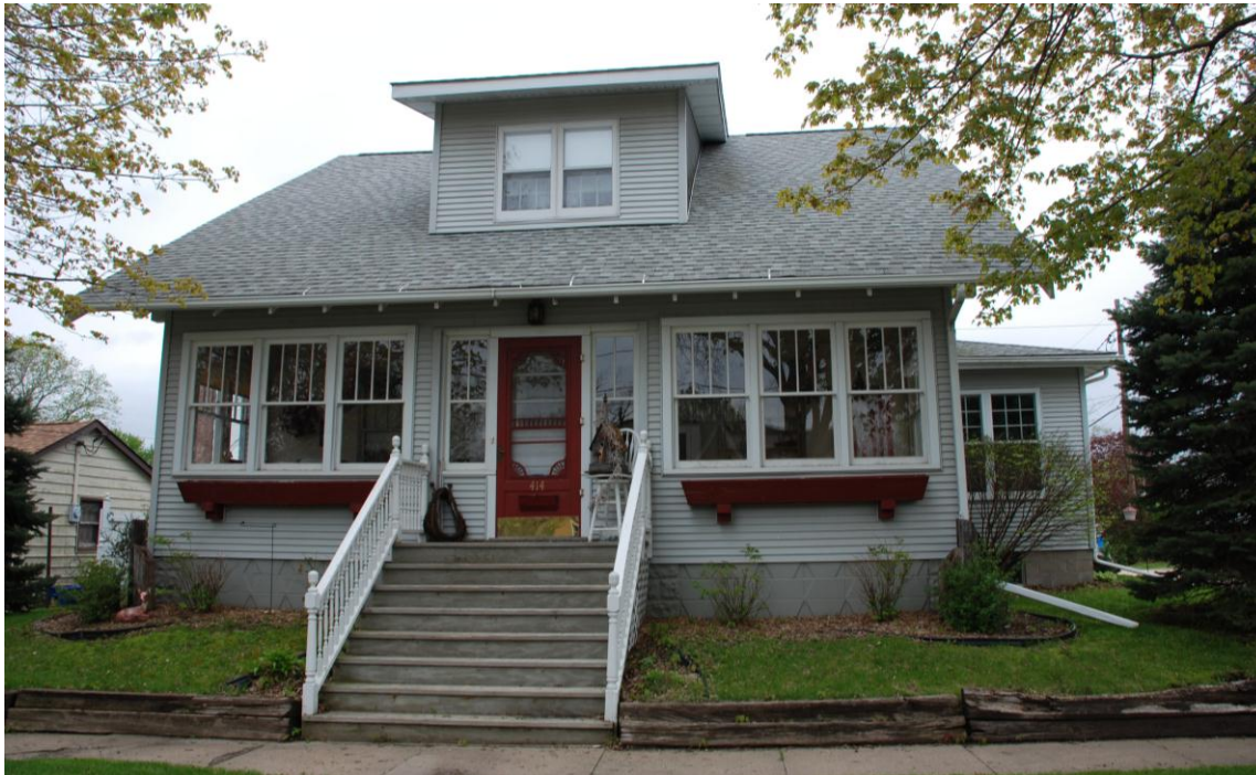
Photographs: 414 2nd St SW, looking west and northwest, 4/7/2014 , Andrew Bell, Svendsen Tyler, photographer.