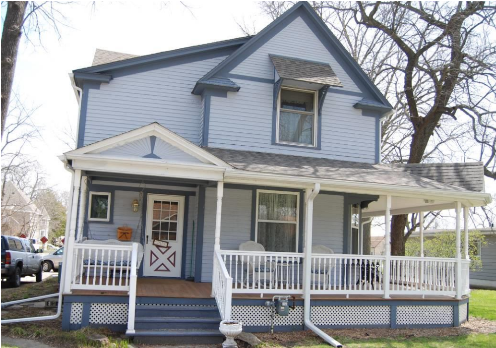
Photographs: 315 4th Street SW, looking east and northeast, 11/30/2014 , Andrew Bell, Svendsen Tyler, photographer.