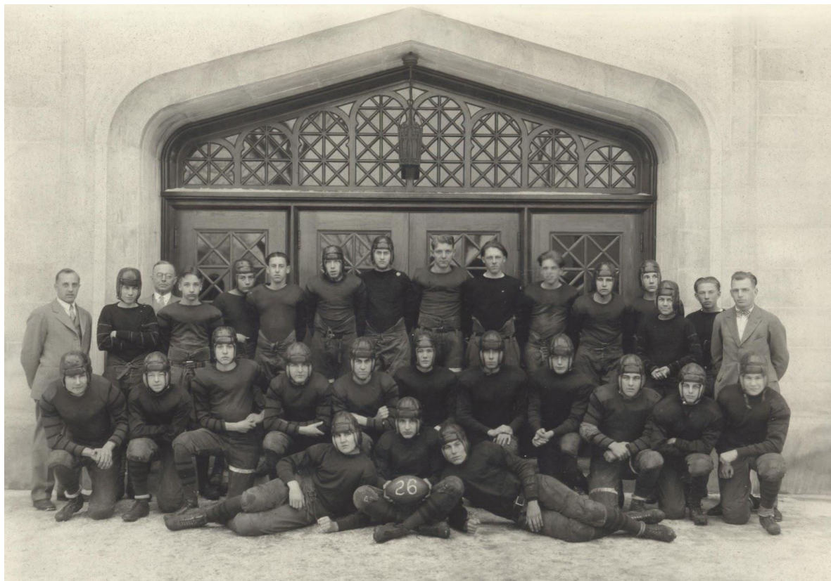
The 1926 football team photographed in front of the entrance to the new high school building.