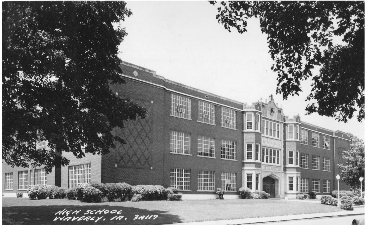
Photo showing the original windows.