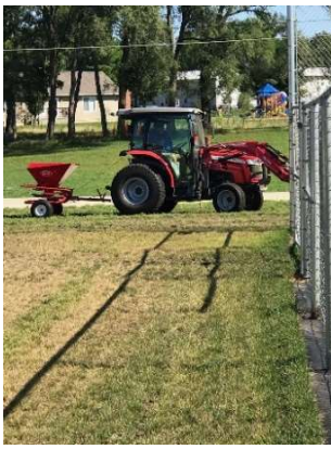
Massey Ferguson Tractor with spreader