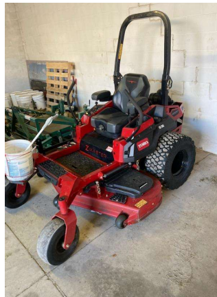
Toro Zero Turn Mower