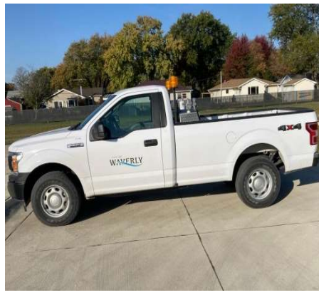
Ford F150 (from Veg Mgt)