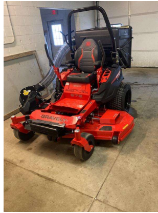
Gravely Zero Turn Mower w/ leaf vac