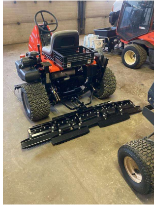
3 Wheel Infield Groomer