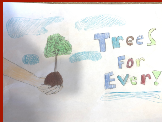
6-12 Age Division: Ellen Wells