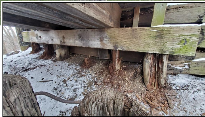
This photo shows the deteriorated piles on the east abutment of the bridge.

Baskins Creek Bridge was originally constructed in 1903 as a railroad trestle bridge. It was converted to a pedestrian bridge in 1999 as part of the Rolling Prairie Trail. Portions of the wooden structure are deteriorated to a condition that will not longer support heavier weights.