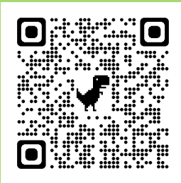
Mulch Delivery Order

Visit http://www.waverlyia.com/public-works/public-services-landing.aspx or scan the QR code to submit your mulch or compost delivery order.