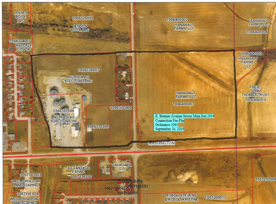
CONNECTION DISTRICT PLAT