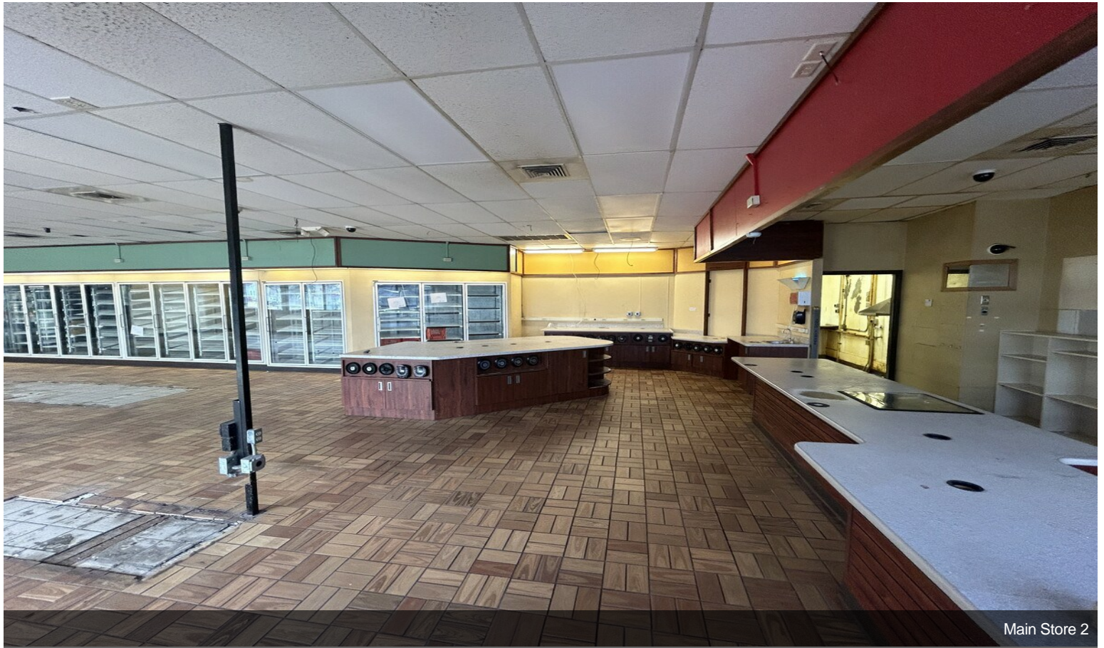
Main Store 2