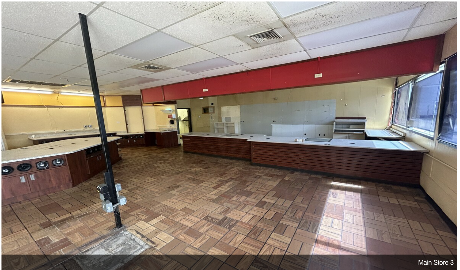
Main Store 3