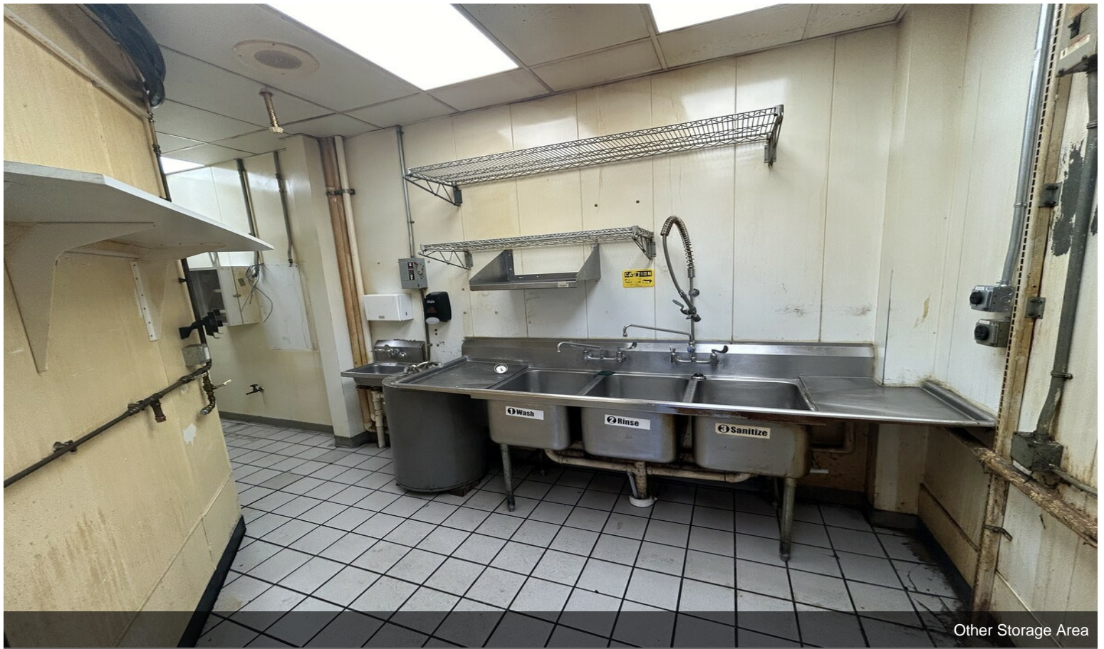
Other Storage Area