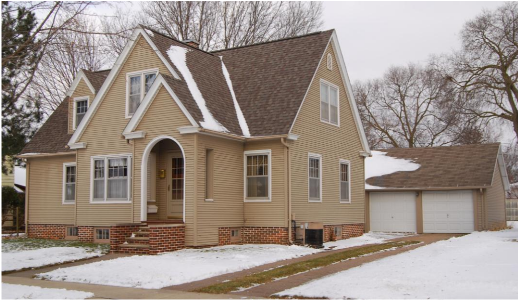
Photographs: 210 3rd Ave SW, looking southeast and southwest, 11/28/2014 , Andrew Bell, Svendsen Tyler, photographer.