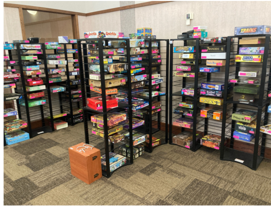
Board games for all ages