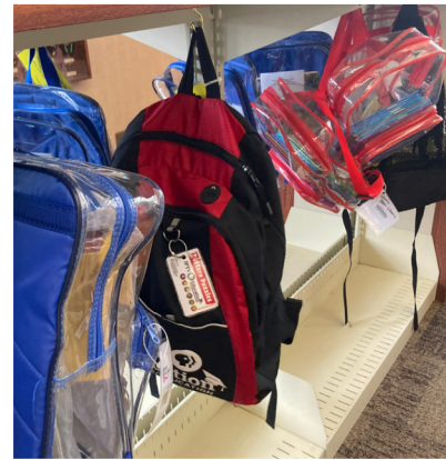
Literacy kits & Me Readers