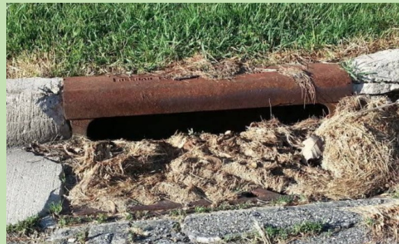
Storm sewer intake clogged with grass.

Please help keep the streets and storm sewers clean and clear! It's illegal to blow grass clippings or leaves into City streets. Residents can help to make sure that storm sewers are functioning correctly by checking the intakes near their homes & clearing them. Contact Public Services to report any concerns.