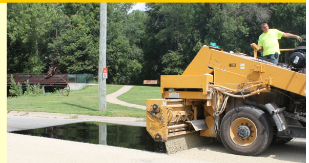
Contractor placing rock over oiled street. As soon as the rock has been placed on street, vehicles may drive slowly on the new surface.

Approximately 100 City blocks will be seal coated, with the majority of the work occurring within the northeast side of Waverly. This project will be completed by mid-August.