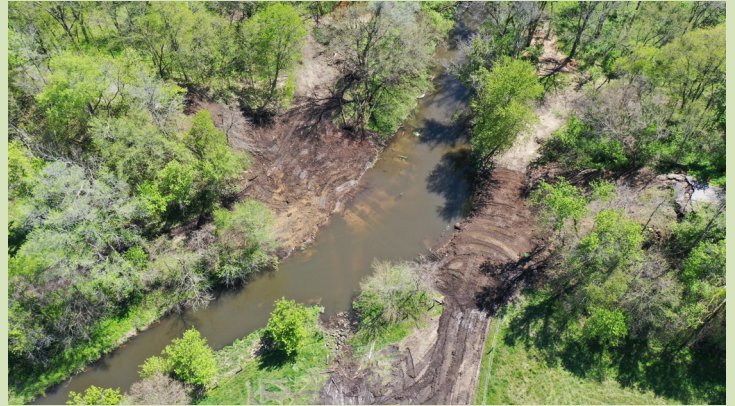
Baskins Creek Trail Bridge – Demolition Complete