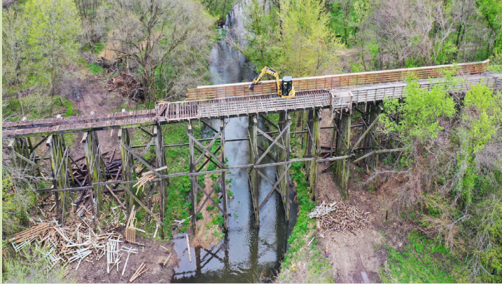
Baskins Creek Trail Bridge – Demolition in Progress